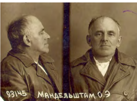
[4] Photo of Osip Mandelstam made by the NKVD after his arrest, 1938.