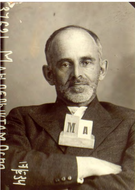
[3] Scanned from Russian edition of Mandelstam's collected work. Mugshot by the en: NKVD after Mandelstam's first arrest, 1934. Public Domain.

He found out. Four months later he was arrested and subjected to an interrogation that made him temporarily psychotic. He and his wife were then exiled to a small city in the south of Russia, where they lived for three years. Mandelstam was re-arrested in May, 1938, during the Great Terror, and died in a Siberian transit camp in December of that year. He has no grave.