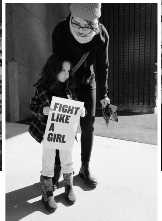
[Ref. 2] Fight Like A Girl, United States.

Congress and the cabinet to employ the 25 th Amendment.