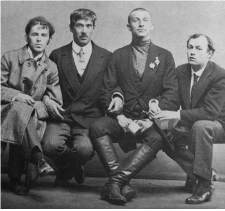
[2] From left to right: Osip Mandelstam, Korney Chukovsky, Benedikt Livshitz, Yuri Annenkov, 1914.

In 1933 it was already impossible to publish such a poem, and Mandelstam knew that if the poem came to the attention of OGPU, the secret police of the time, the punishment would be severe. His act of protest, therefore, was less in writing the poem than it was in reading it in a circle that was made up not only of relatives but also of people who were not so close. There are at least two ways of viewing this act. It can be seen as heroic, a poet's defiant assertion of his freedom as more precious than his life. It can also be seen as suicidal. The fact that some people present did not know everyone else well enough to be sure that not one of them would denounce the poet made the pressure great to be the first to denounce lest someone else be first and they then be viewed as a co-conspirator. Thus Mandelstam knowingly made himself the canary in the coal mine, to see how bad things had become.