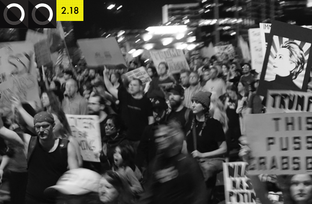
[Ref. 1] Members of One Resistance, an alliance of Progressive groups in Austin, Texas, march across the 1st Street Bridge in protest of the inauguration of Donald Trump as 45th President of the United States.