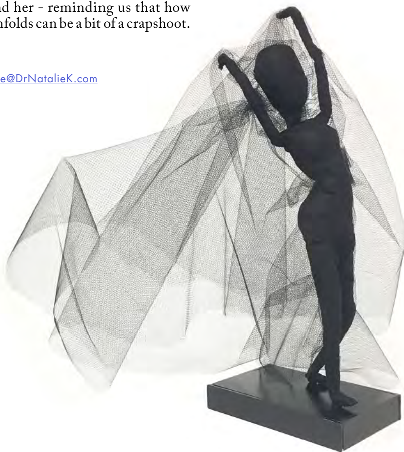
*Forrester's sculptures can be viewed in ROOM's online .

My most recent sculpture is called Against the Wind . It was inspired by my wish to emerge from the darkness strong and triumphant. —