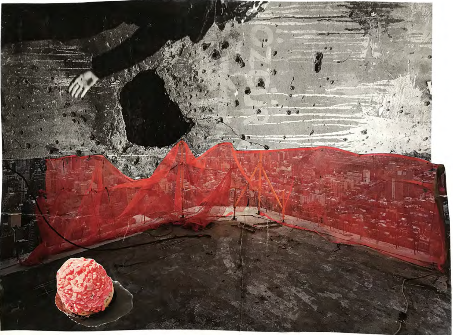
Collage by Leah Lipton