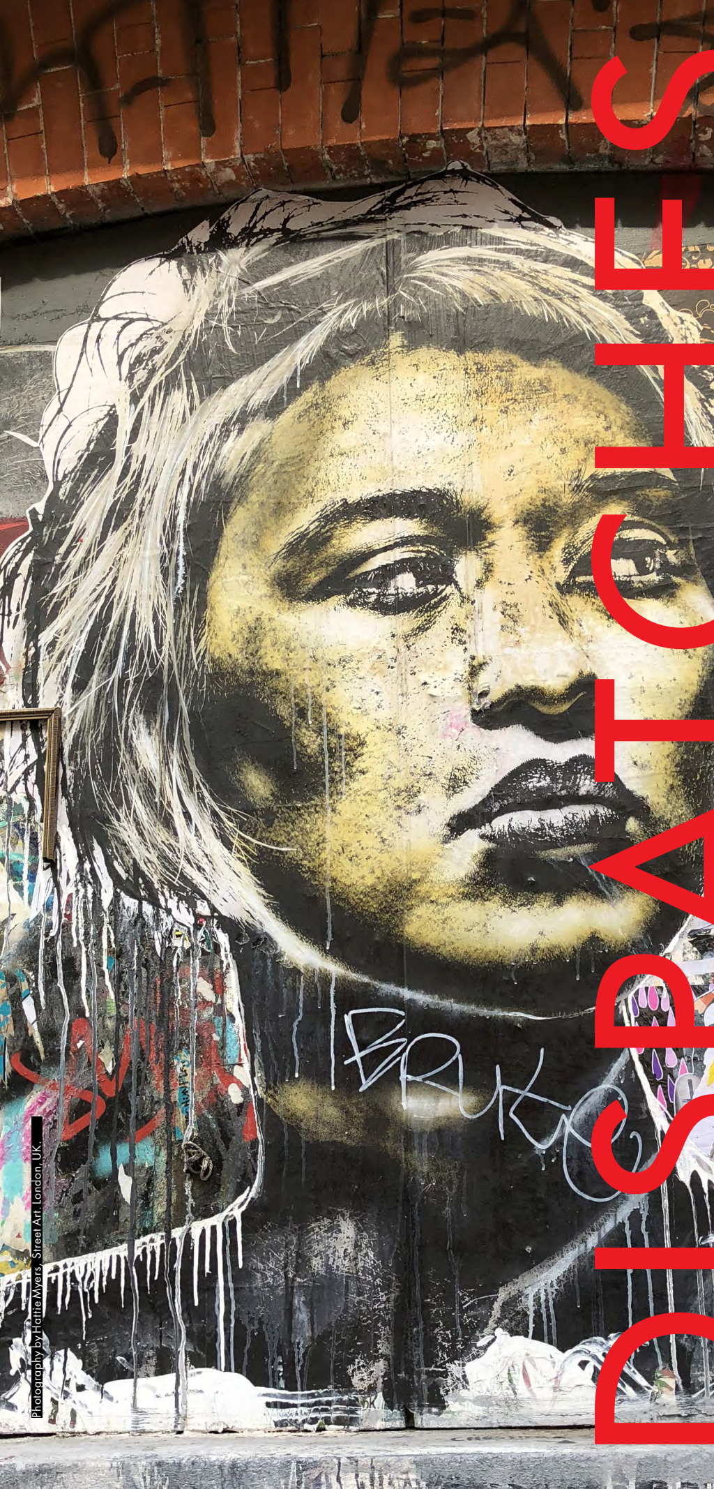
Street Art, London, UK

ASSOCIATION FOR THE PSYCHOANALYSIS OF CULTURE AND SOCIETY